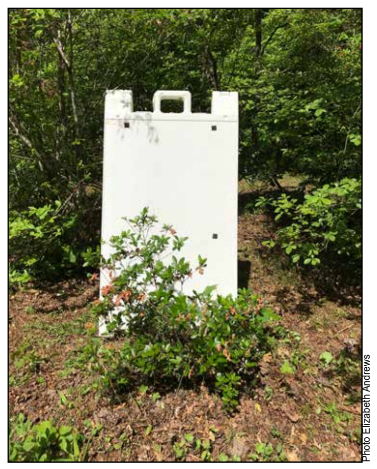
▲ Photo 2—After pruning, the azalea is reduced to no more than half the sandwich board's height.