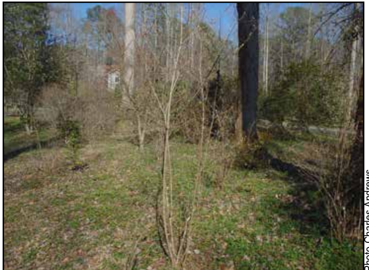
▲ Photo 6—An unpruned R. colemanii that could have been pruned when young to be more compact, with less distance between branches.

Our native azaleas tend to have a pleasant, natural habit, which varies according to the species and variety. Some are low growing. These include Rhododendron atlanticum , R. canadense , R. viscosum var. aemulans and R. viscosum var. montanum . Some can be low or get a little taller, including R. alabamense , R. flammeum , R. cumberlandense , R. periclymenoides , R. prinophyllum , and other forms