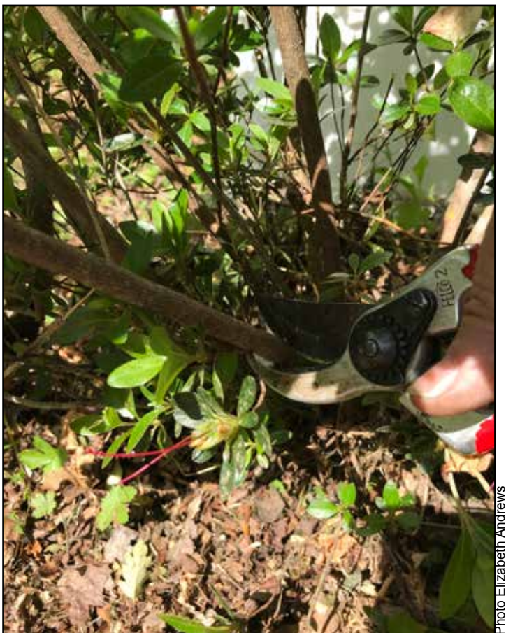
▲ ▼ Photo 3 & 4—Close-ups of pruners ready to cut back unwanted leggy growth. The cuts are made just above where he wants to generate new growth.

Many do not realize that some azalea cultivars can reach heights of 8 to 10 feet and even more. Many old cultivars originally considered low growing are only slow growing and now we know they can eventually reach medium and tall heights. There is a whole spectrum of heights down to dwarf plants less than a foot tall. Simply choosing an appropriate cultivar and location can practically eliminate the need to prune. Examples are: Low— Satsuki, e.g., 'Amaghasa', 'Eikan', 'Flame Creeper', 'Gumpo'; nakaharai , e.g., 'Mount Seven Star', 'Wintergreen'; Robin Hill, e.g., 'Hilda