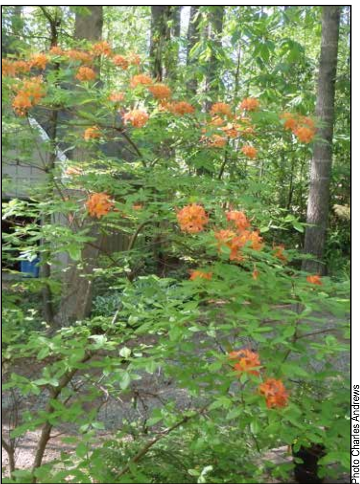
▲ Photo 8—A mature, unpruned native azalea natural hybrid. Note the rounded crown that has developed.

Deciduous azaleas often have multiple trunks. While species such as R. calendulaceum usually have only two or three, R. canescens can have as many as a dozen. To avoid a jumble of side branches, prune out branches growing across