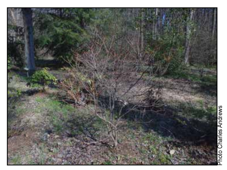
▲ Photo 7—An unpruned R. arborescens growing in a good bit of sunlight. Note its compactness.

rejuvenate a neglected plant that has overgrown its location. [See Photos 5-8, Pruning Deciduous Azaleas.]